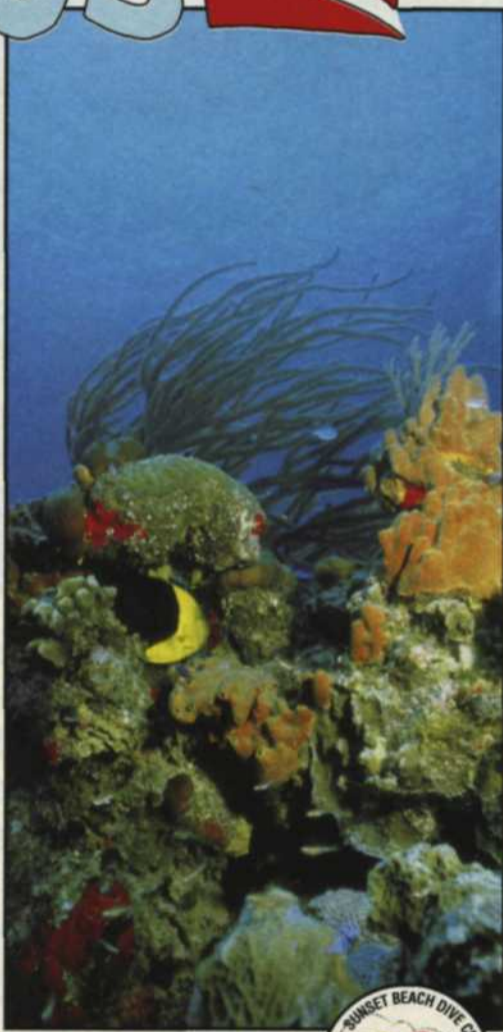
Dive Photo: Dale Sanders