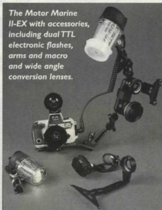
The Motor Marine II-EX with accessories, including dual TTL electronic flashes, arms and macro and wide angle conversion lenses.

Access to the film compartment is through a single O-ring sealed back plate. Sea & Sea uses a very pliable blue ring with a special grease that provides a surefire seal. To open the camera, simply move the right locking lever forward and the backplate swings out of the way. Drop a roll of film in with the leader