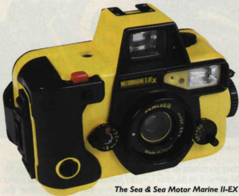
The Sea & Sea Motor Marine II-EX is amphibious, with a built-in 35mm lens and flash. Top: Pastel soft corals revealed by the Motor Marine II-EX.

Divers often hesitate to get involved in underwater photography simply because they don't know how to get started. The list of initial questions can be overwhelming. What camera do you buy? How do you use it? What kind of film do you use? Which lens is best to start with? How much will it set me back? Of course, every photographer you ask will have slightly different advice, but the solution is actually quite simple. The key to an easy entry into underwater photography is a system that can adapt and grow as your experience increases. It must be simple and easy to use, but allow you added creativity as your photo skills evolve.